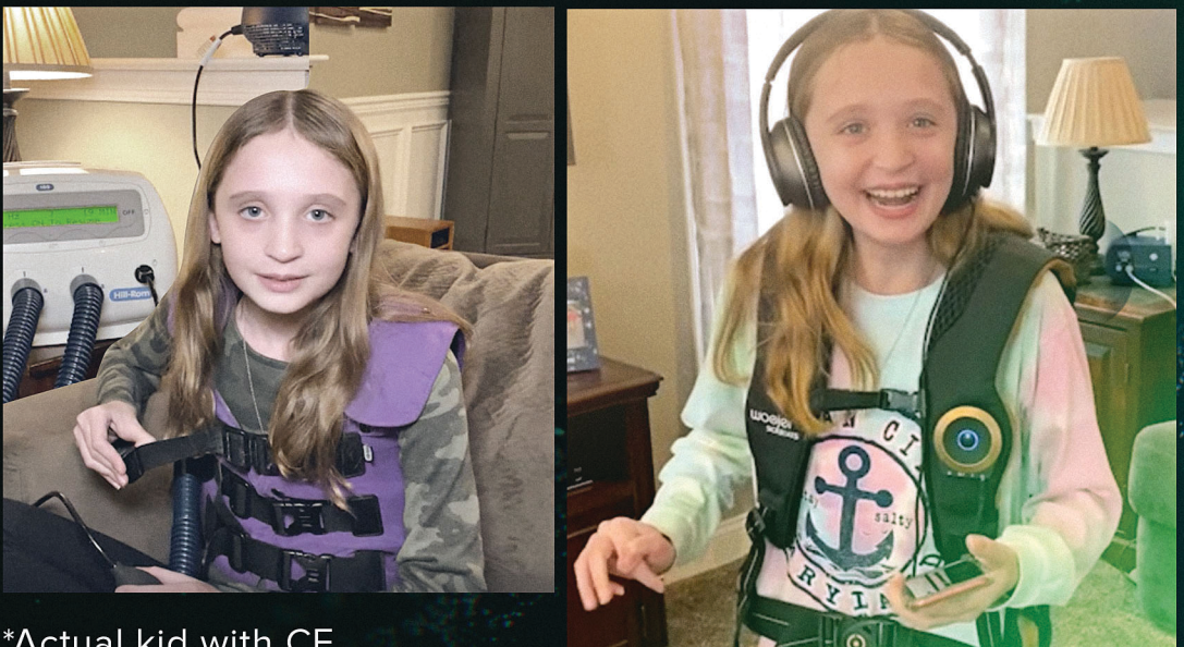
*Actual kid with CF

For kids with cystic fibrosis (CF), airway-clearance therapy is the worst part of their day. Twice a day, they have to wear a giant vest that pounds the chest in order to loosen mucus.